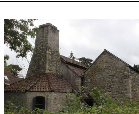
Saltford Brass Mill