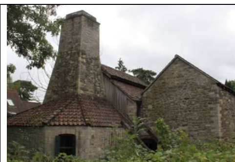
Saltford Brass Mill