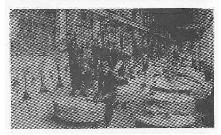
Upper picture : A view, c1910, of a millstone maker's yard at la Ferté-sous-Jouarre. A block is propped up showing the eye and workers pose with their tools. To the left a stone appears to be complete. A number of processes can be divined. Lower picture : A millstone factory in la Ferté-sous-Jouarre area, c1905.

Editors note : la Ferté-sous-Jouarre is 67 kilometres east of Paris, just off Autoroute A4 (Paris-Reims) Michelin map 56