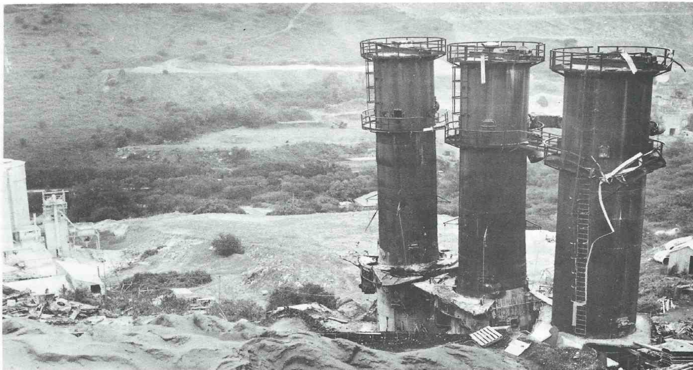
Callow Rock Quarry 1971. Demolition of the three steel bodied limekilns, which were fuelled by producer gas manufactured on site.