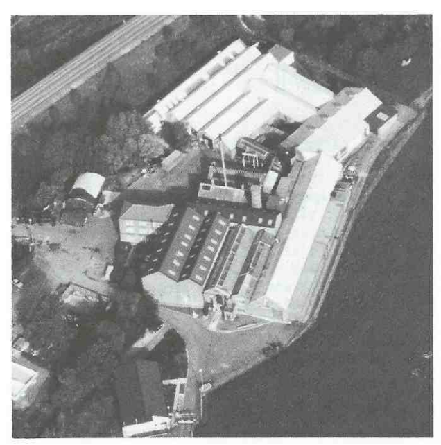
Bathford Mill, the only paper mill in the world totally specialising in non-banknote high security mould paper.

Both mills continued to concentrate on lightweight paper until they were purchased by Portals in 1972. In 1973 production of all lightweight papers was moved to Ryburndale,