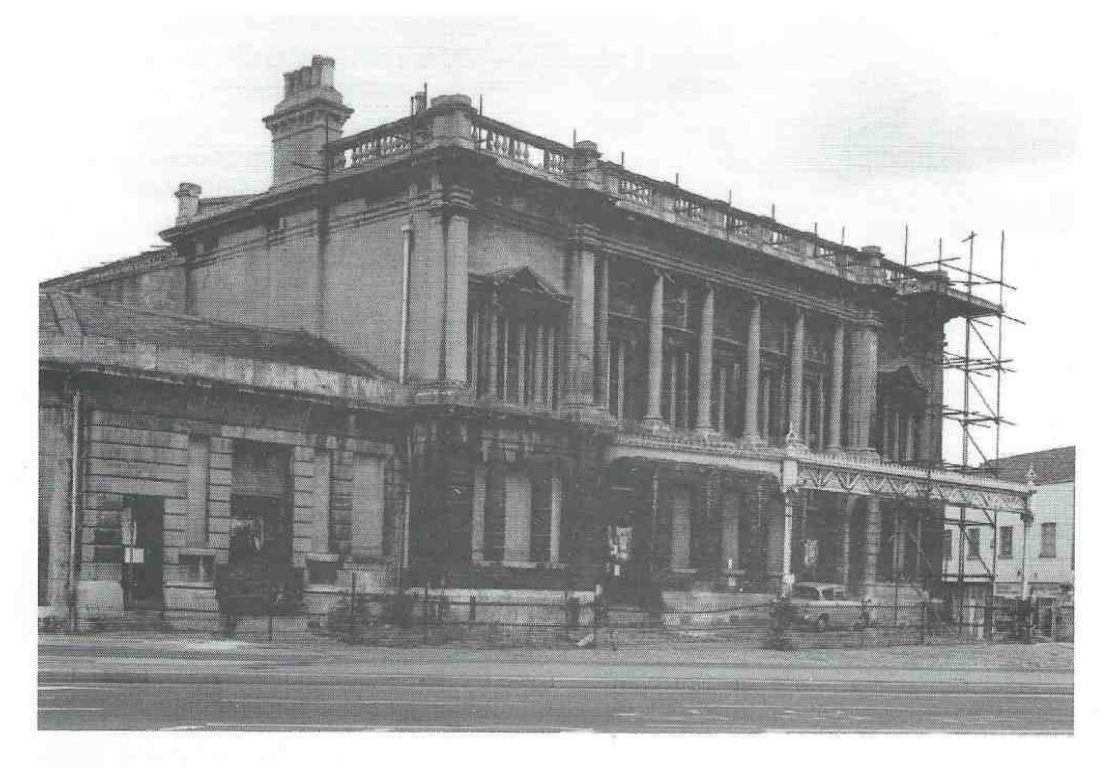
Bath Green Park Station before restoration

So BIAS came into being and has now enjoyed a quarter of a century of vigorous existence. It has always tended to be a general purpose and educational organization rather than a project-centred society like many other IA bodies, and I consider that this has helped it to survive and to undergo periodic revitalisations as personnel have changed and old interests have faded away. But it has, in the process, taken part in many substantial preservation exercises. Most of these have been at least partially successful, but there have also been a number of serious failures. The late 1960s, in particular, witnessed several sad losses. The Shot Tower on Redcliff Hill was sacrificed in the interests of road widening, and even though it was replaced by a modern tower which kept the process going in Bristol for another generation, it seemed a poor exchange for